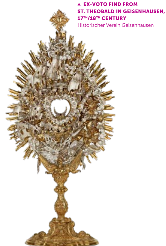
▲ LEPANTO MONSTRANCE, 1708 Bürgerkongregation Maria vom Sieg, Ingolstadt

Media stations and touch-and-smell stations allow further exploration with all the senses at many places in the exhibition.