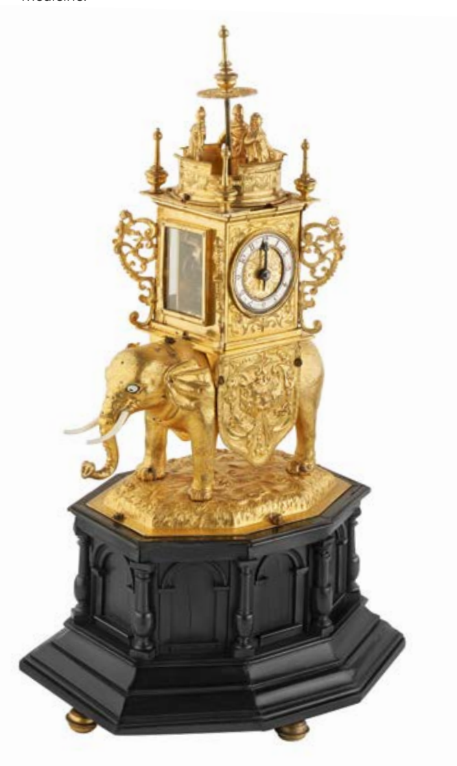
▲ AUTOMATON CLOCK IN THE FORM OF AN ELEPHANT, CA. 1600 Kunstsammlungen und Museen Augsburg

A "period face" greets visitors in every section: A Baiuvarii woman, Knight Templar, Anabaptist, merchant, and mirror coater introduce themselves in gallery-filling media installations. They tell about their lives and the way of the world – the village priest from Seehausen am Staffelsee ponders the French Revolution, the Anabaptist from Augsburg faith and persecution, the Jewish physician from Würzburg plague and medicine.