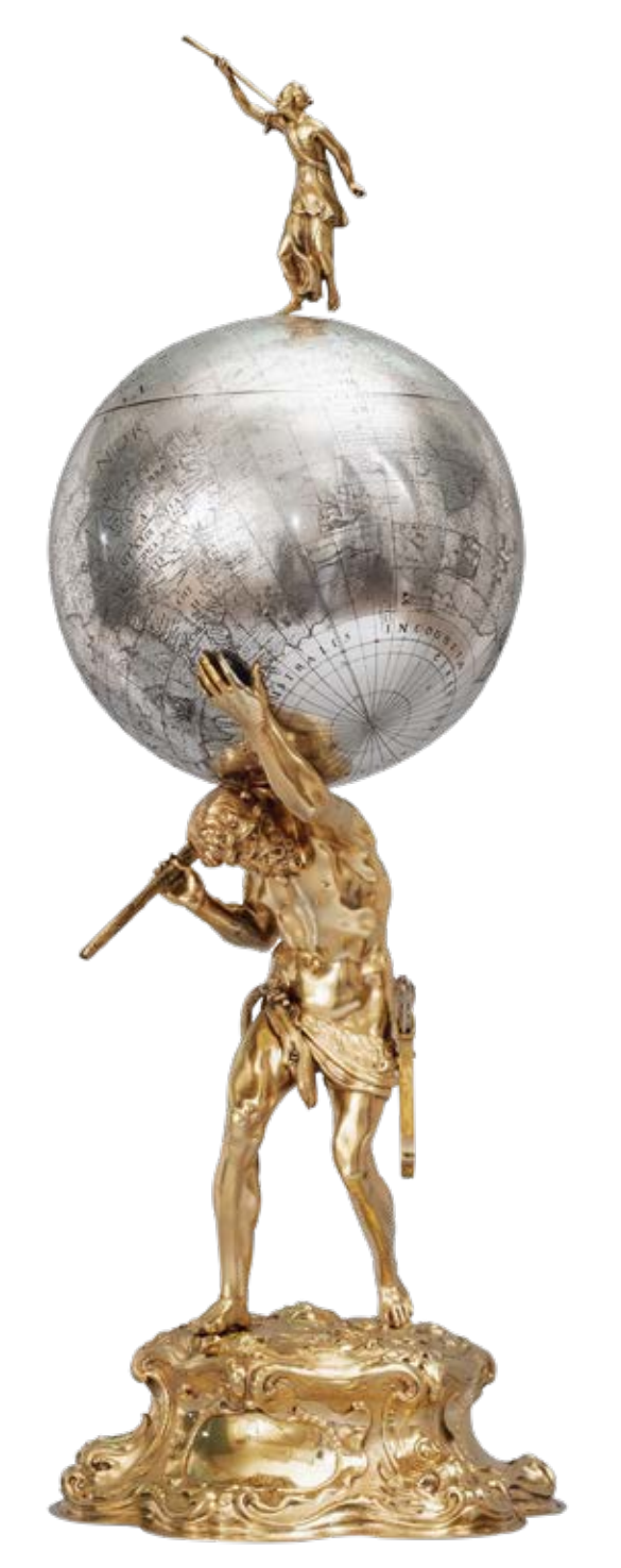
▲ GOBLET IN THE FORM OF A TERRESTRIAL GLOBE, 1618 – 30 The Royal Court. Sweden, Stockholm

THE BAVARIAN STATE EXHIBITION "ONE HUNDRED TREASURES FROM ONE THOUSAND YEARS" LOOKS BACK ON THE PERIOD FROM AROUND 600 TO 1800. ONE HUNDRED EXHIBITED OBJECTS FROM BAVARIA, GERMANY AND EUROPE ILLUMINATE OVER ONE THOUSAND YEARS OF BAVARIAN HISTORY AND HIGHLIGHT BYGONE ERAS.